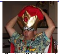
President Otto Schimmel

LCIF Allocates Final $2 Million, All $15 Million Now Allocated for Tsunami Relief